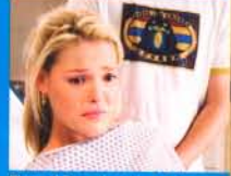
Planned Parenthood is grieving.