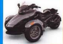
Tricycles for mutant children.

Our bizarre survey—now more intrusive than ever!