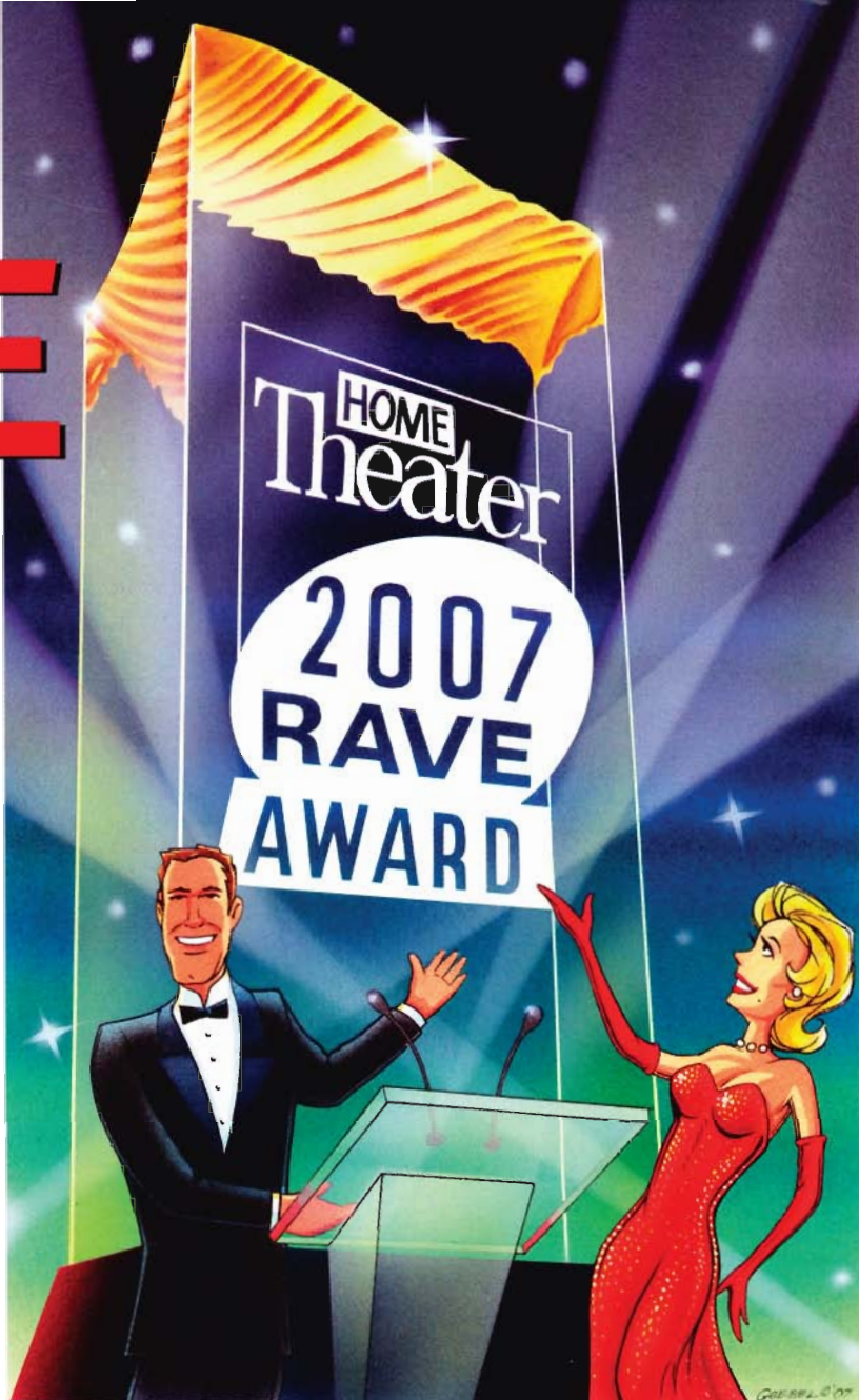
Illustration by Joe Gruchel

* Pricing information was correct at press time of original reviews.